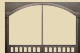
Jamestown Front Black & Pewter