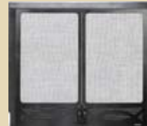
Harbor Front Pewter & Bronze