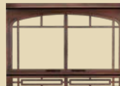
Arts & Crafts Front Black, Nickel & Pewter