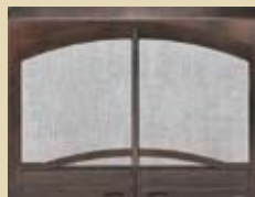
Phoenix Retreat Front Pewter & Bronze