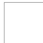
Wood Fiber - primed

Available ready to finish and customize with the paint or stain of your choice. See Wood Mantel and Natural Stone or the Cast Mantel catalogs for complete list of available mantel and surround options.